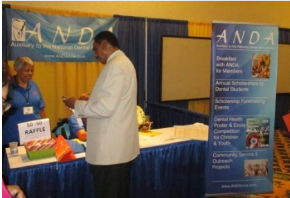
ANDA in the Exhibition Hall