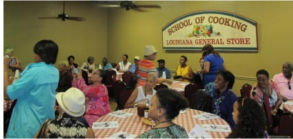
New Orleans School of Cooking