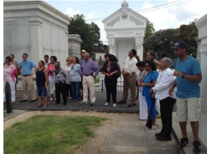
"New Orleans Highlights" City Tour