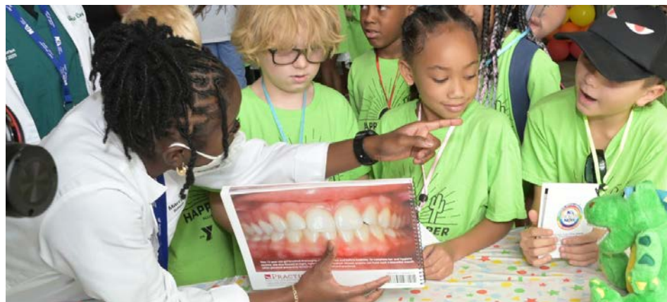
Dental students educating metro-Phoenix summer campers

debt than non-HURE; thus educational debt may be a disincentive to apply or enroll. 3 The NDA-HEALTH NOW® Project includes partnerships with schools, camps, and community recreation centers that allow for interaction with children ages 4-17. The NDA uses a step ladder approach to mentoring where dentists mentor dental students, dental students mentor pre-dental students, pre-dental students mentor high school, middle schoolers, and elementary school children. It is especially important that young children see doctors and students in white coats that “look like them.” This is a model that works.