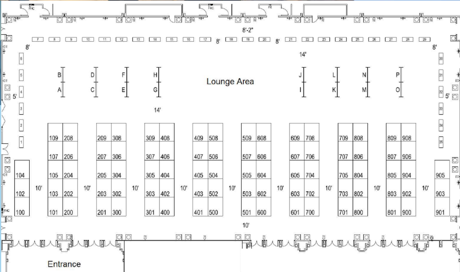
EXHIBIT FLOOR PLAN